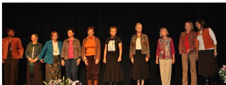
Breast Cancer Survivors on the Runway